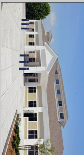
Louis D. Petrine Transportation Center