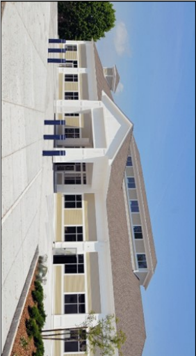
Louis D. Pettine Transportation Center

Route 7 Bay Street Southeastern Regional Transit Authority