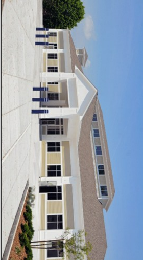
Louis D. Petrine Transportation Center